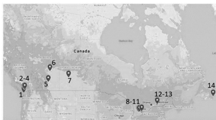
FIGURE 1. Canadian Postsecondary Institutions Represented in Survey Data

The majority of Canada's postsecondary institutions are publicly funded by the federal and provincial govern-